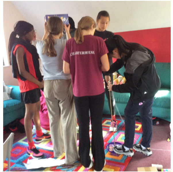
Our Fourths enjoying some team building on Monday