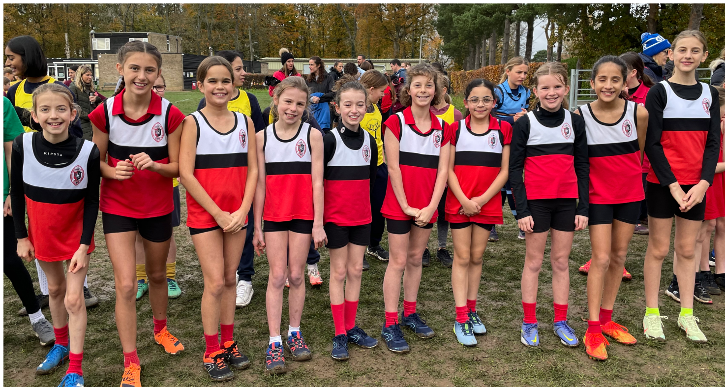
Some of our super speedy Cross Country runners