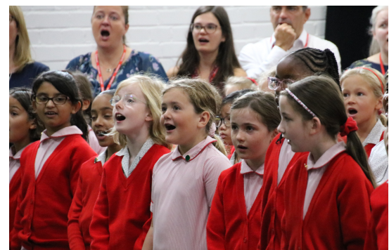
Girls in Main School singing Finem Respire at the top of their voices!