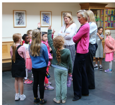
Our new starters meeting the Form 1 Teachers