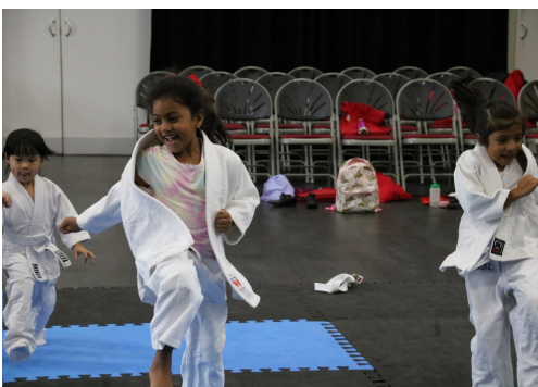
Enrichment Clubs started this week and Lodge enjoyed their Judo!